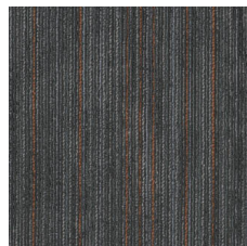
→ Action Terracota 57587

→ Quick Ship 2 Weeks - up to 2,500 square yards from USA