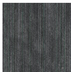
→ Action Forest 57581