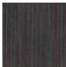
→ Action Garnet 57585