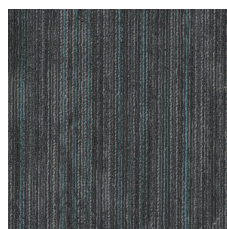
→ Action Aqua 57583