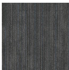
→ Action Blue 57584