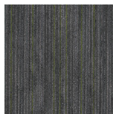
Action Green 57586